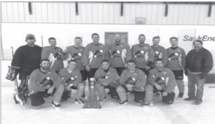
'A' Final Winners - Beaver Busters