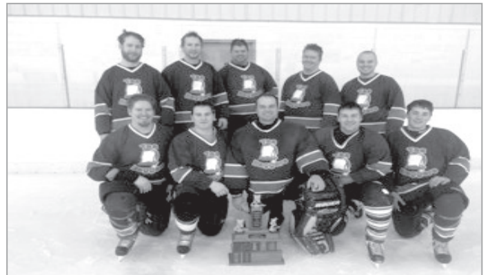
Consolation round winners The T-Baggers.