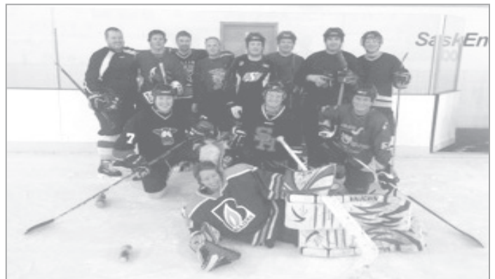
Short Shifts Long Shafts won the 'C' Final