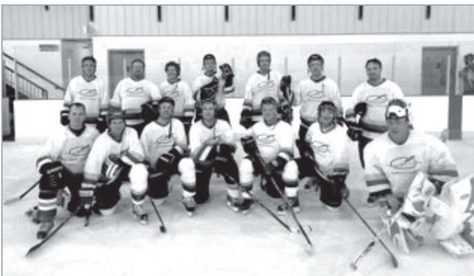
'A' Side Losers - Schmidt's Sticks